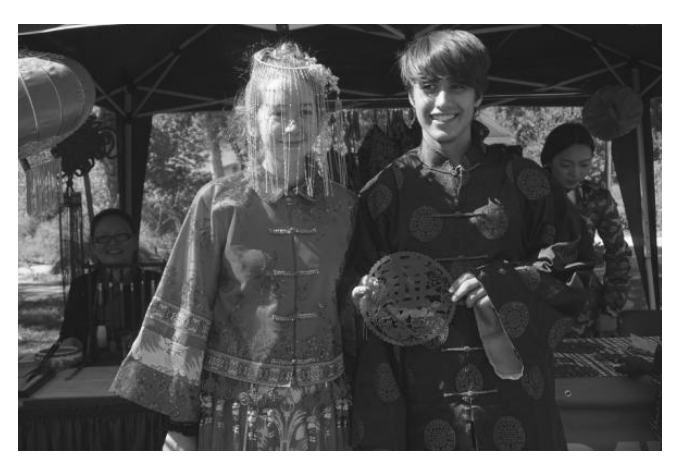
Figure 5. Americans dressed up in Chinese wedding costumes (The picture was taken in the U.S. in 2018).