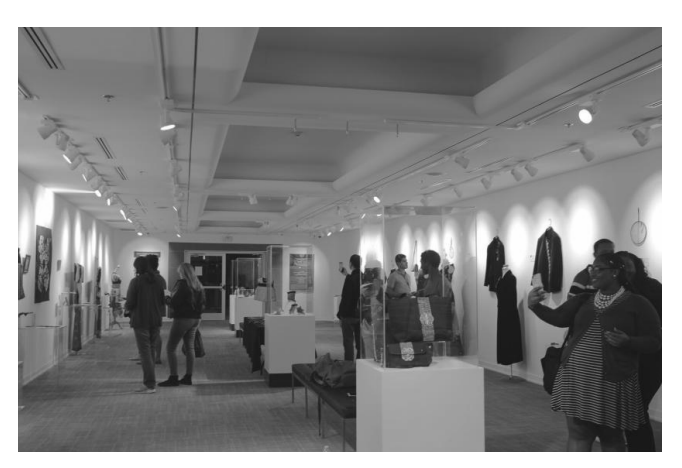
Figure 3. Real static display about ancient Chinese costume fabrics and crafts (The picture was taken in the U.S. in 2018).