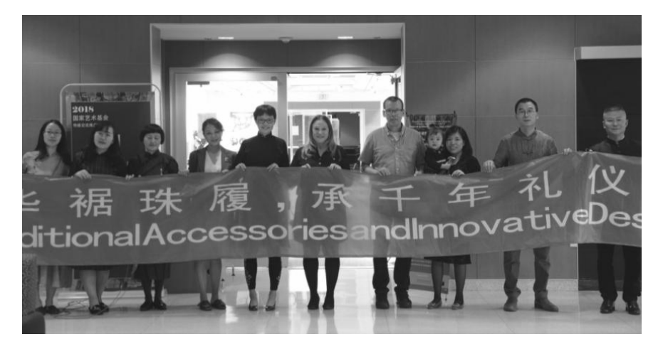
Figure 6. Picture of members of the overseas dissemination of Chinese costume culture (The picture was taken in the U.S. in 2018).

Finally, in order to effectively understand the recognition, acceptance and spread of traditional Chinese costume culture overseas, this article takes the communication site of the North Carolina State University Station as an example where a questionnaire survey of 127 local visitors was conducted. The survey uses the Likert 7 scale, which uses seven numbers "-3,-2,-1, 0, 1, 2, 3" to express the seven attitudes of "disagreement, comparative disagreement, general disagreement, neutrality, general agreement, comparative agreement and very agreement" for visitors to choose from. Ta -